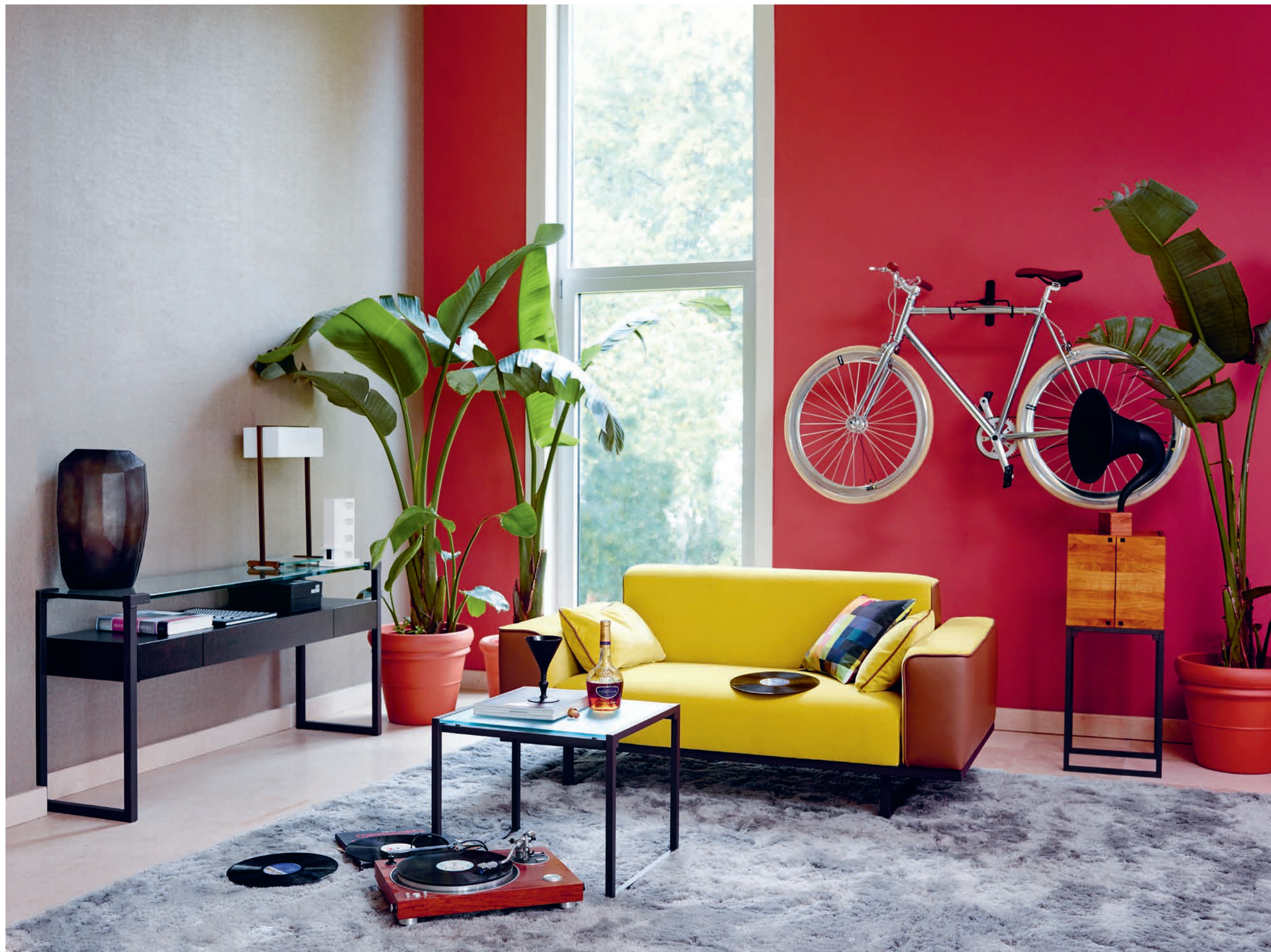
Sofa—Safari GP02 Console table—Pioneer T53 Cabinet—Duet C01 Side table—Duet T73 Lamp—Safari MW10