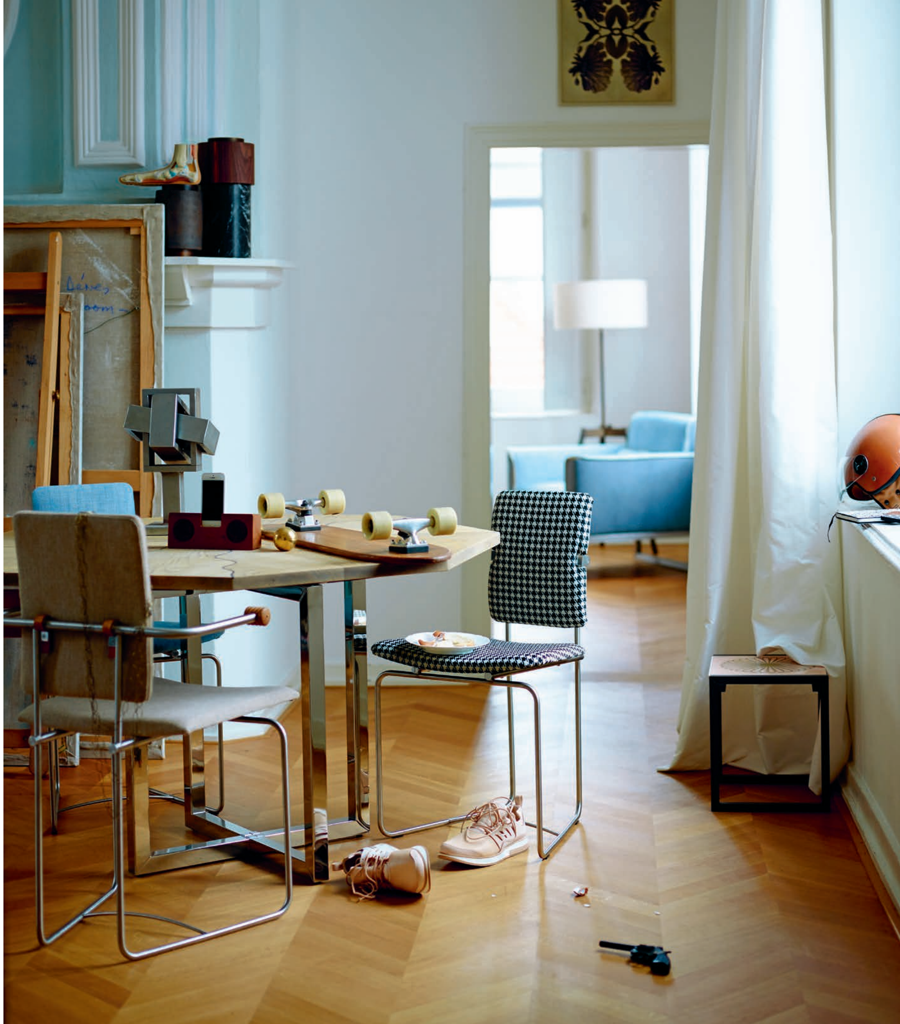
Chair—Safari S02 Dining table—Pivot T48 Chair—Concept Side table—Duet T73 Lamp—Vintage Concept Armchair—Safari GP02