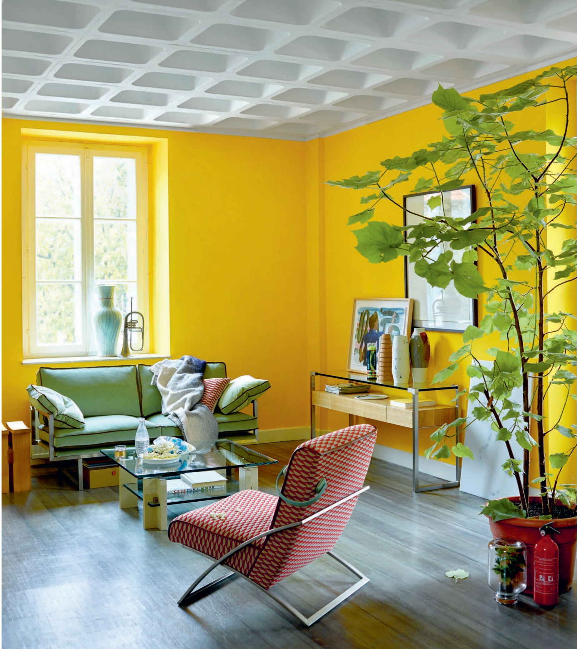
Armchair—Concept Coffee table—Pioneer T57 Console table—Pioneer T53 Sofa—Safari GP01 Stool—Vintage