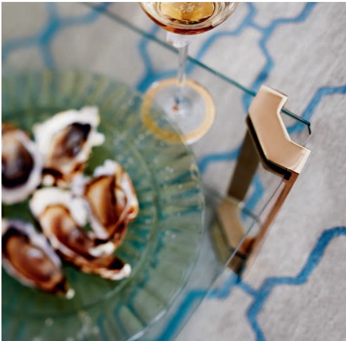
Right Side table—Pioneer T79 Side table—Pivot T82 Side table—Pivot T82 Side table—Pioneer T37