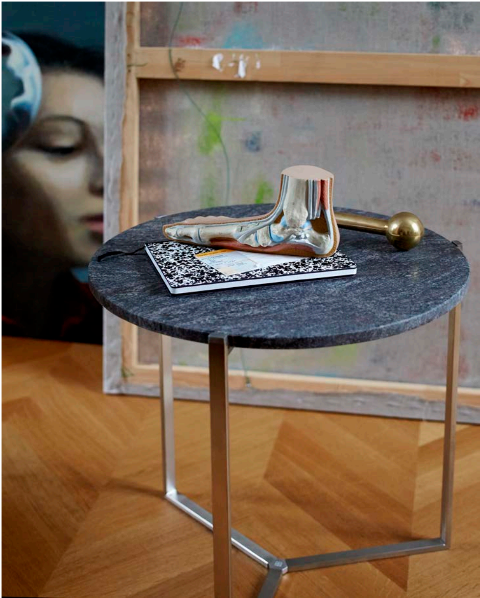
Right Coat rack—Safari G01 Side table—Pioneer T66