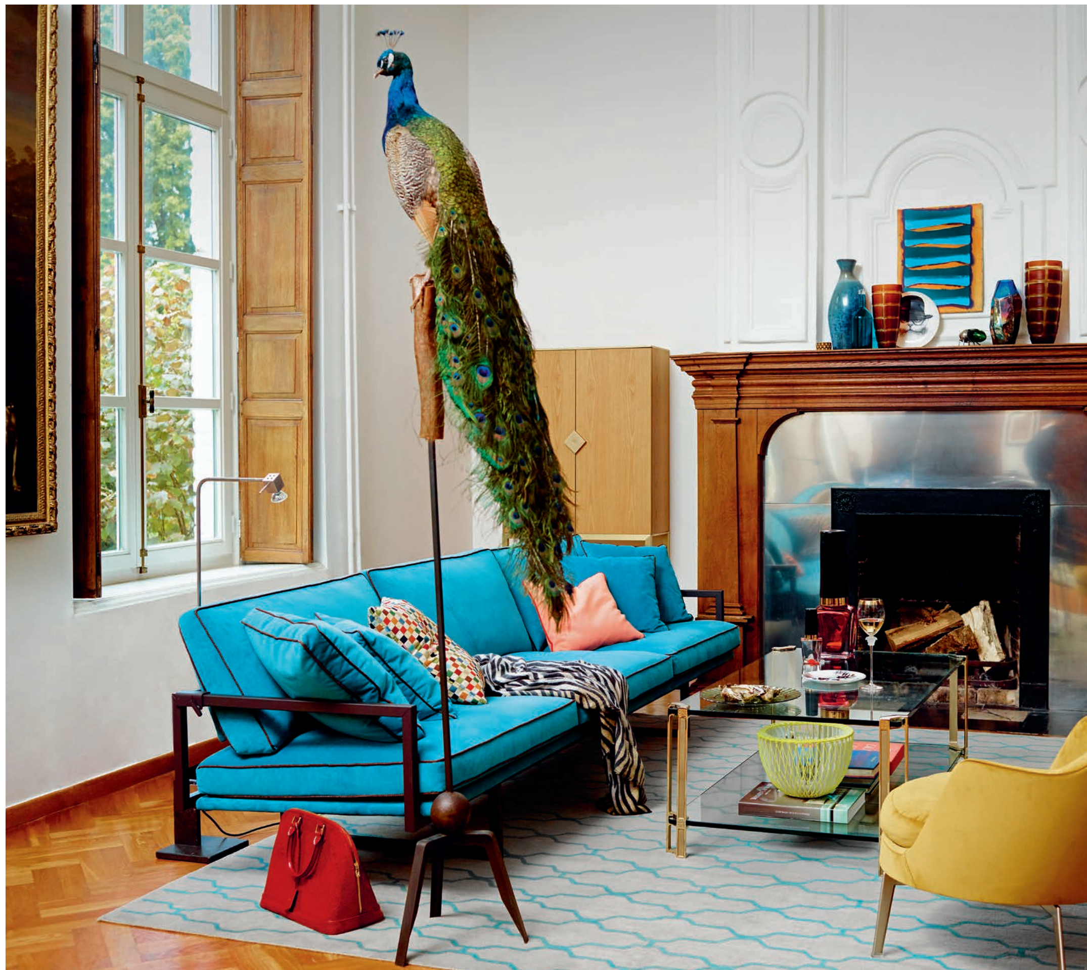
Sofa—Safari GP01 Lamp—Vintage MW11 Coffee table—Pioneer T24 Cabinet—Biri C03