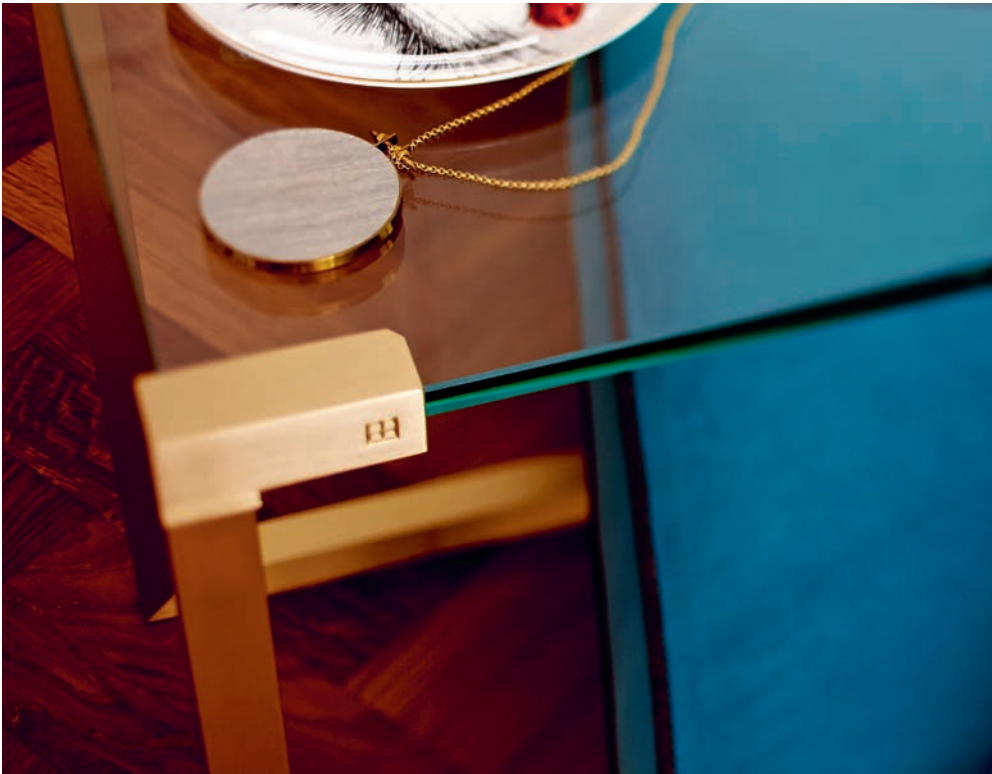
Left top Side table—Pioneer T53